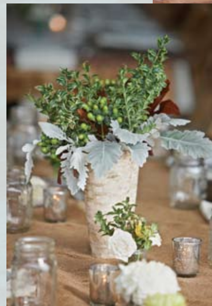
Creating space for mid-size meetings, events, and life-long connections

Often our mid-size gatherings are squeezed into a room that is too small or they are dwarfed in the Worship Center because it's way too big. We are excited to create a necessary room with roughly a 200 to 300-person occupancy to hold any one of the many mid-sized gatherings we host throughout the year. We'll have a place for dinners, receptions, mini conferences and training events as well as any number of ministry gatherings.