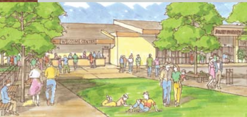
New greenbelt with park seating

So this is how it will work, the thrift store will move to where "The Other Room" currently is. It will be located with the other retailers on our campus, next to Shear Illusions and Red Sea Marketing. The new and